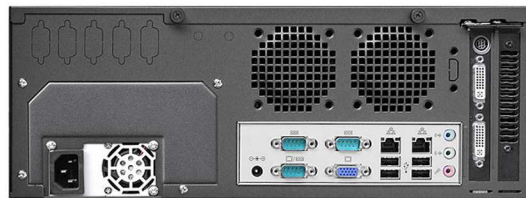
1U FlexATX power supply installed mode