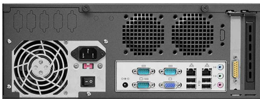
PS2 power supply installed mode