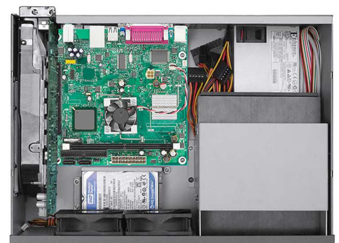
1U FlexATX power supply installed mode