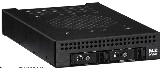
RW225-M2 1x3.5" FDD to 2 x M.2 SSD Removable Cage M.2 NVMe 64G