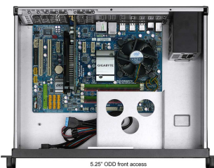
5.25" ODD front access