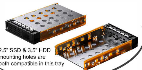
2.5" SSD & 3.5" HDD mounting holes are both compatible in this tray